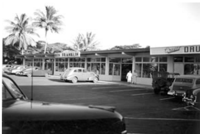
The original Ben Franklin Store in Kahului, Maui

Maui Varieties Limited is parent company to the popular Ace Hardware and Ben Franklin Craft stores.