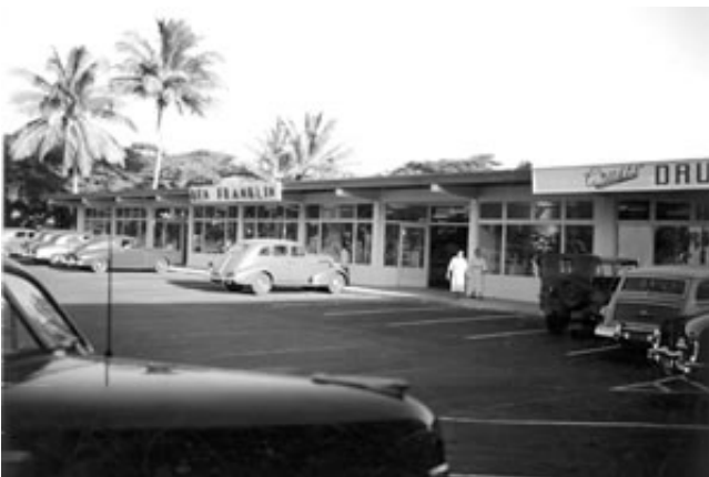
The original Ben Franklin Store in Kahului, Maui

Maui Varieties Limited is parent company to the popular Ace Hardware and Ben Franklin Craft stores.